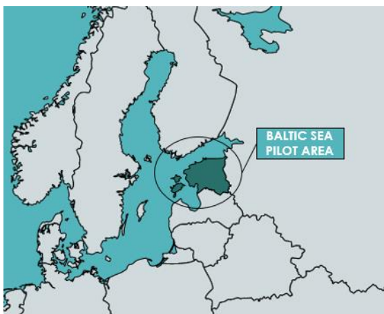
Figure 1: Baltičko pilot područje

Glavne identificirane snage uključuju brojne koristi koje doprinose održivosti i očuvanju okoliša kao očuvanje i poboljšavanje karakteristika tla i smanjenje emisija stakleničkih plinova, benefiti za industrije asocirane s projektom i lokalno stanovništvo, poljoprivrednike i ribarsku industriju. Slabosti uključuju prihvaćanje projekta i projektnih rezultata, poteškoće asocirane s implementacijom i korištenjem dobivenih proizvoda i tehnologije, operativni troškovi. Prilike uključuju otvaranje novih radnih mjesta, izvor prihoda od nusproizvoda, smanjenje količine otpada i troškova odlaganja, moguća ulaganja od strane EK, razvoj vještina. Prijetnje uključuju konkurentno tržište gnojiva i natjecanje s ostalim tehnologijama oporabe nusproizvoda, izazovi za postojeće EU i nacionalne regulative i legislative, ovisnost EU-a o uvoznim nutrijentima.